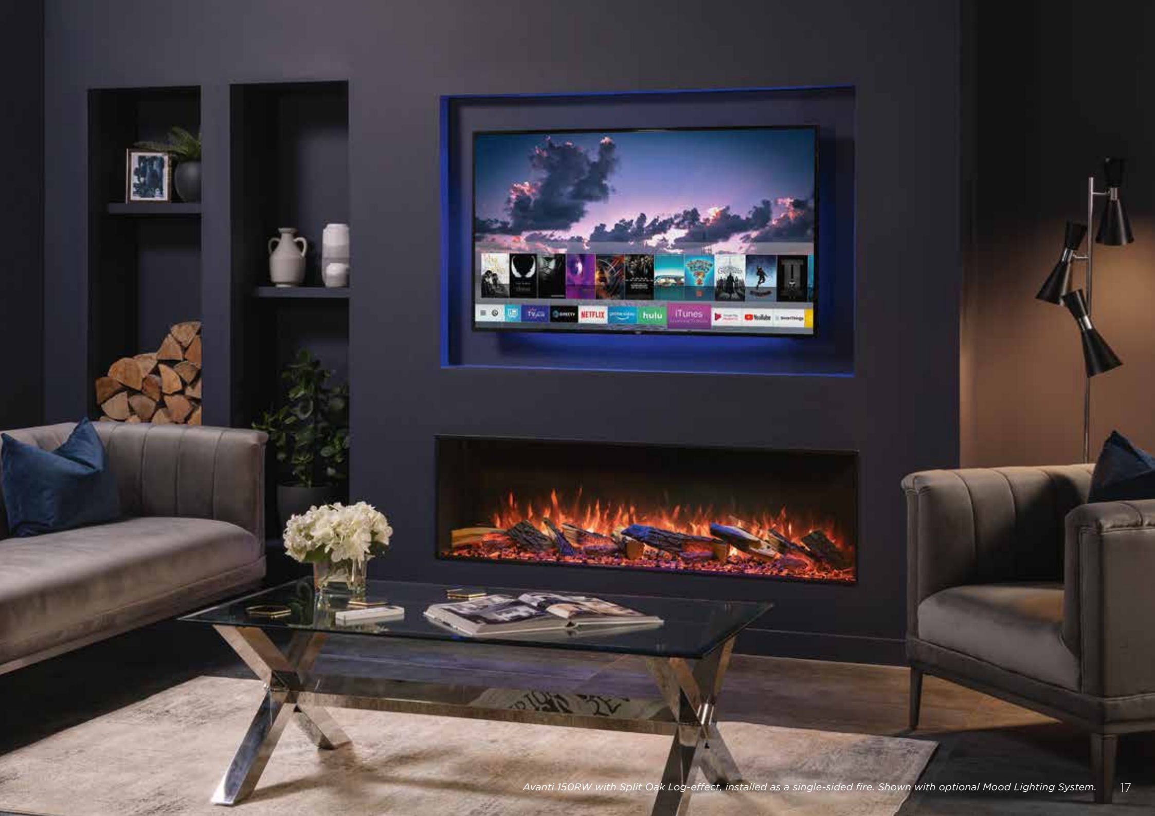
Avanti 150RW with Split Oak Log-effect, installed as a single-sided fire. Shown with optional Mood Lighting System.