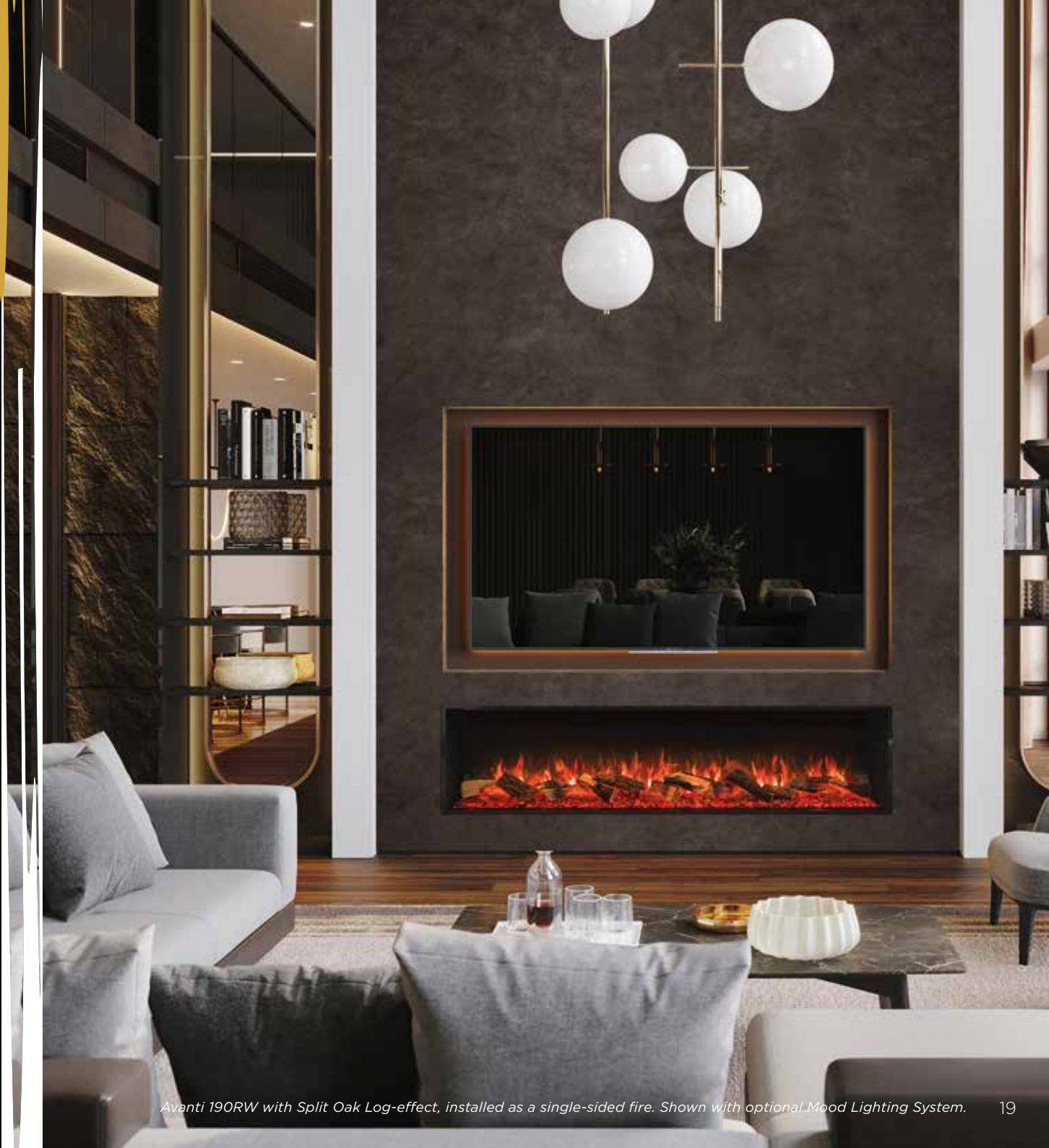
Avanti 190RW with Split Oak Log-effect, installed as a single-sided fire. Shown with optional Mood Lighting System.

See pages 3, 7, 11 & back cover for additional images