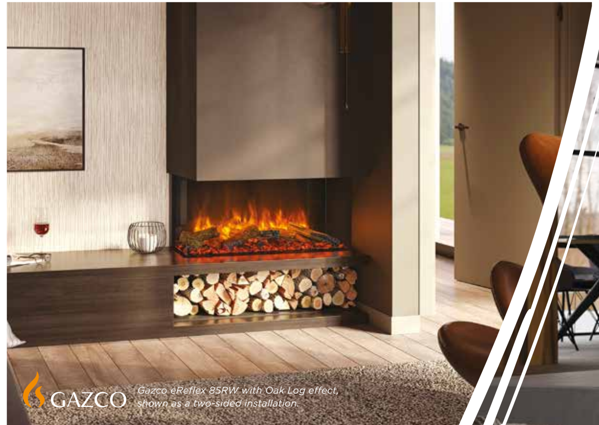
GAZCO Gazco eReflex 85RW with Oak Log effect, shown as a two-sided installation.

The Stovax Heating Group's prestigious electric fire collection also extends to the Gazco eReflex and eStudio ranges, alongside the Orbit - Onyx's very own gravity-defying ceiling-hung electric fire.