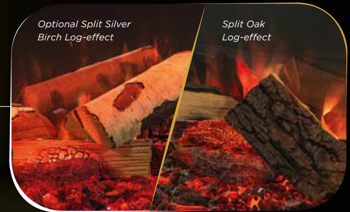
Split Oak Log-effect