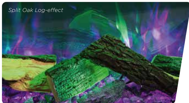
Split Oak Log-effect

*TV sizes refer to the standard diagonal screen dimension that TV manufacturers state when describing the size of their products. If sizing your existing flat screen TV, measure diagonally from the top left of the screen to the bottom right to find the TV's advertised size. We also recommend measuring the width and height of your TV if lining it up with the Avanti below.