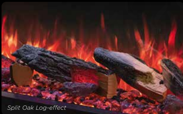
Split Oak Log-effect

See pages 3, 7, 11 & back cover for additional images