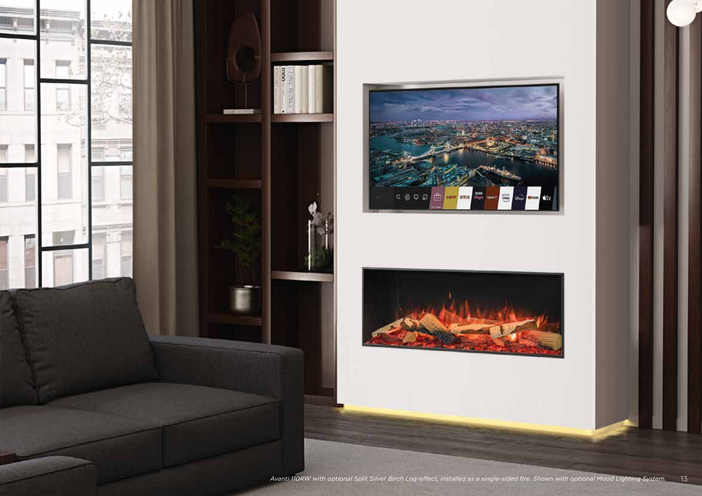
Avanti 110RW with optional Split Silver Birch Log-effect, installed as a single-sided fire. Shown with optional Mood Lighting System.