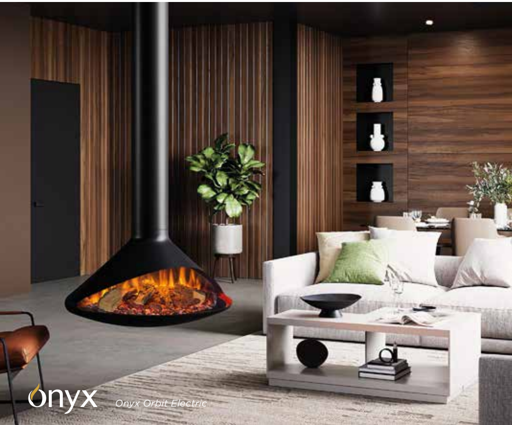
onyx Onyx Orbit Electric