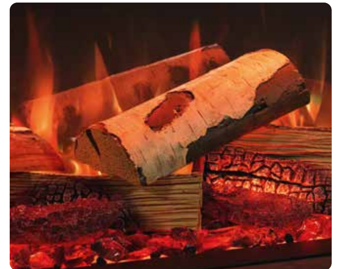
Optional Split Silver Birch Log-effect