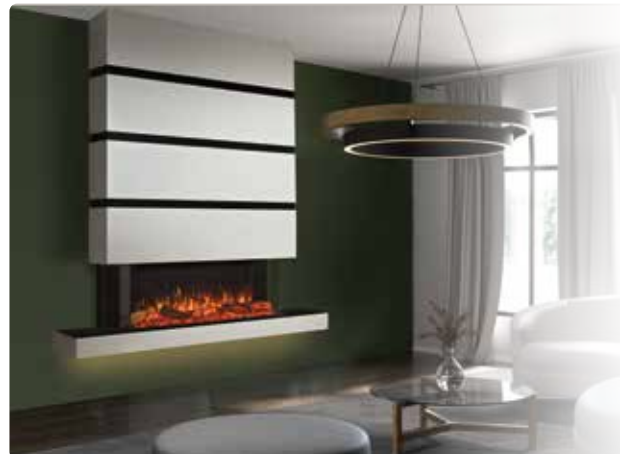
Avanti 110RW with Split Oak Log-effect, installed with Milazzo Suite floating shelf and four top sections in white.